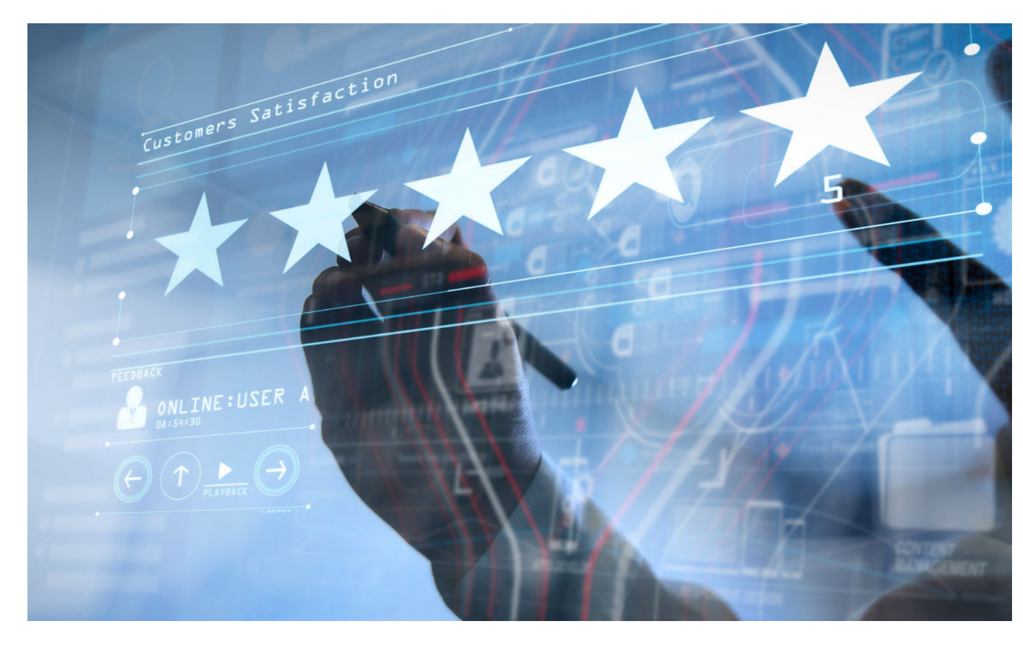
Support, 24/7 handling, multilingual hotline, etc. The provider must offer a high-quality after sales service and the required corrective actions to resolve all incidents at any time. All these services require significant resources that only a reliable partner that is both a software publisher and integrator is able to provide you.

Once launched, training will help you roll out your project. As such, Savoye offers, through its training service, optimal user support for its solutions either via in-person training sessions or virtual classes using e-learning modules.