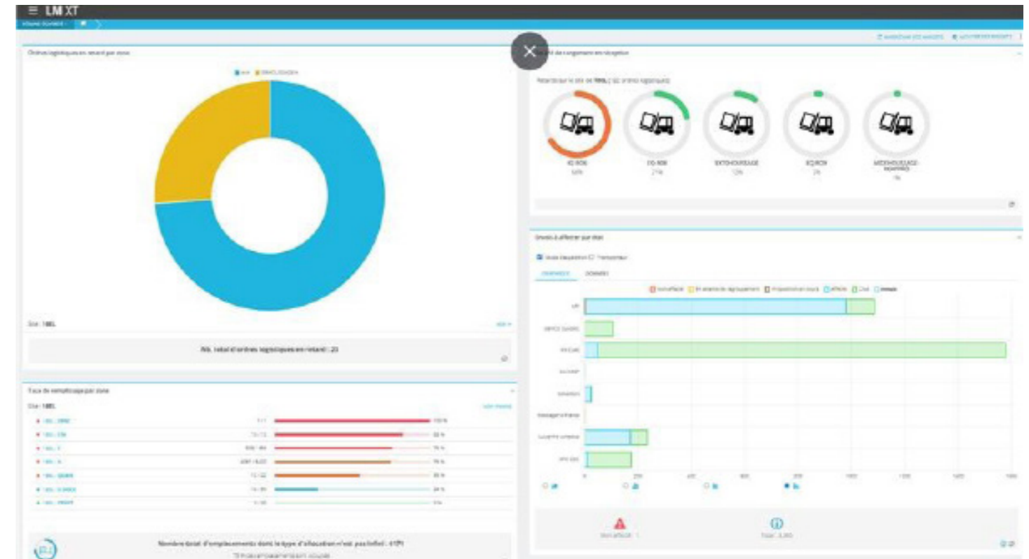
Example of ODATiO cockpit screen

In addition, a key certain user profiles can also create his/hertheir own widgets and make them available to colleagues within the organization. As with a business intelligence tool, the a user can has access to many indicators and , of which they can specify their the mode of presentation, graph or pivot table, and with or without filter;apply filtering andto one or several categories.